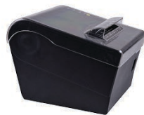
Splash Proof Cover