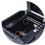
Double Paper Near End Sensor